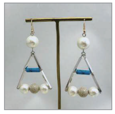
Triangle Gem Earrings Price ¥9,000