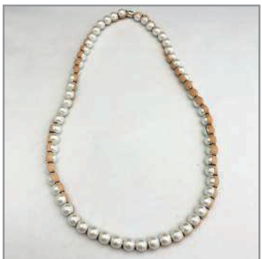
Leather pearl necklace Price ¥10,000

[What is INASO resin] INASO resin is made from old rice, hemp and agricultural waste(Ogara). INASO is the world's first biomass resin made with patented technology.