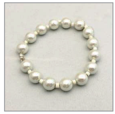
Gemstone bracelet Price ¥7,000