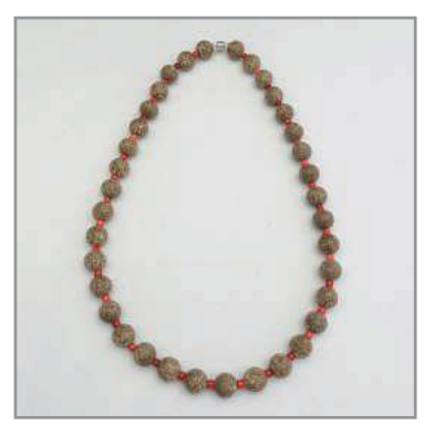
Gemstone Necklace Price ¥9,000