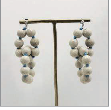
Ring earrings Price ¥7,000