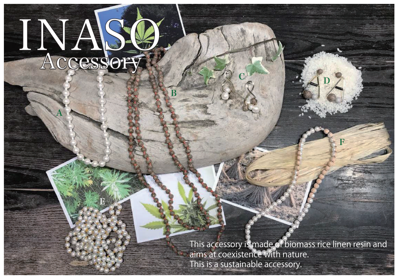
A.Gemstone Necklace:Price ¥9,000 B.Silk cord long necklace:Price ¥15,000 C.Moebius Earrings:Price¥21,000 D.Triangle Gem Earrings:Price ¥9,000 E.Silk cord long necklace:Price ¥15,000 F.Leather pearl necklace:Price¥10,000

We are starting a project of "INASO accessory". This accessory is made of biomass rice linen resin and aims at coexistence with nature. This is a sustainable accessory.