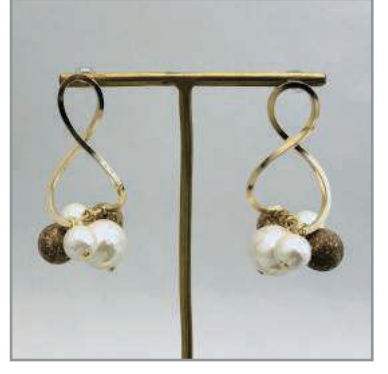
Moebius Earrings Price ¥21,000