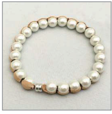
Leather pearl bracelet Price ¥6,500