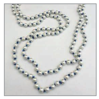
Silk cord long necklace Price ¥15,000